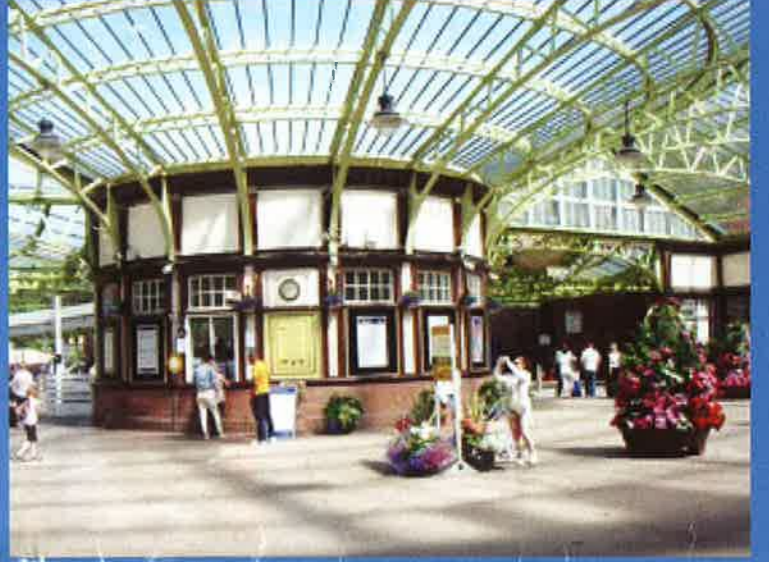
WEMYSS BAY STATION, WEMYSS BAY