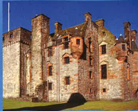
NEWARK CASTLE, PORT GLASGOW