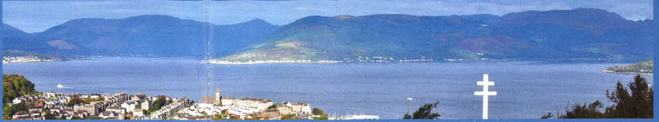
VIEW FROM LYLE HILL, GREENOCK