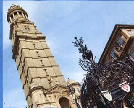
CLYDE SQUARE, GREENOCK