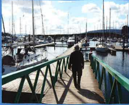
INVERKIP MARINA, INVERKIP