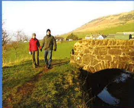
THE CUT, GREENOCK