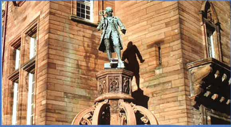
STATUE OF JAMES WATT, GREENOCK