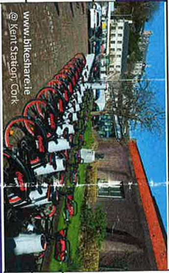
www.bikeshare.ie @ Kent Station, Cork