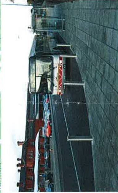
Train & Bus Interchange facility at Kent Station, Cork:

The Cork-Cobh Railway line opened in March 1862 – and celebrated it's 150th Anniversary in March 2012. Thank you for travelling with Iarnród Éireann Irish Rail.